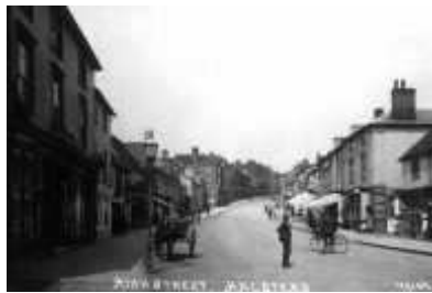
High Street, Halstead Reproduced courtesy of Footsteps' Shop on Ebay. Quality reproductions of old photographs.

Note: the directory lists the names in the following order: Surname, First Name. It also abbreviates names. These have been reversed and typed in full to assist research.