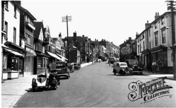
Halstead, High Street 1952

History of Halstead >> White's Directory 1848