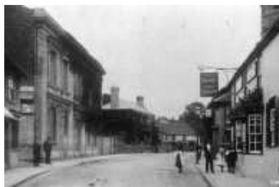
Head Street, Halstead