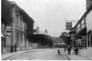
Head Street, Halstead

Reproduced courtesy of Footsteps' Shop on Ebay. Quality reproductions of old photographs..