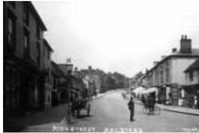
High Street, Halstead

Reproduced courtesy of Footsteps' Shop on Ebay. Quality reproductions of old photographs..